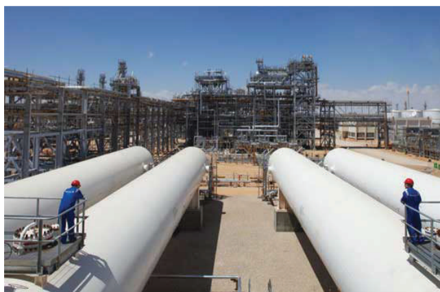
Oman - Petrofac yibal kuff project

The contract covers a strategic importance for Termomeccanica Pompe for various reasons. First, it allows to further consolidate the company's relationship with both its client, Petrofac, and with the end-user, PDO (Petroleum Development Oman). Furthermore, the supply of six of the VS6-type pumps will be carried out in Alloy 825, a noble material. The choice of this material by the customer is mainly motivated by the will to optimize costs which is currently driving the Oil & Gas market. Alloy 825 (Incoloy 825) is indeed a fully austenitic nickel-iron-chromium super alloy which is very resistant to corrosion whether by stress (SCC) or localized (pitting, crevice). This is an illustration of the attention Termomeccanica Pompe pays to adapting to the increasingly stringent standards of its customers, in the Oil & Gas world but not only, which are intended to improve the reliability of critical system components such as centrifugal pumps, and consequently to reduce maintenance costs.