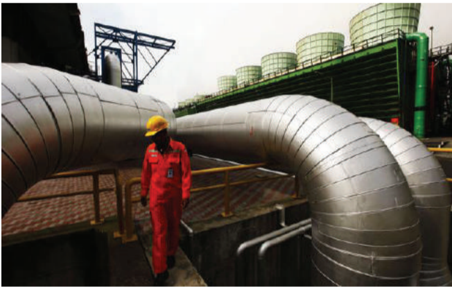
Thermal pipes_kamojang geothermal power plant

Last July, Termomeccanica Pompe's Service Division was awarded the order for a bare-shaft pump for the Kamojang Geothermal Power Plant, located in the western area of the island of Java in Indonesia. This contract is part of the project assigned to the Italian EPC contractor Ansaldo Energia by the end user Indonesia Power (a PT PLN company) for the complete refurbishment of the 30MW unit of the plant and corresponds to the replacement of one of the three pumps from the original Russian supply (the other two will be reconditioned by local companies). TMP will use the "316L" austenitic stainless steel for the wet parts of the pump while the remaining parts will be in carbon steel. The pump delivery is scheduled for late May 2017.