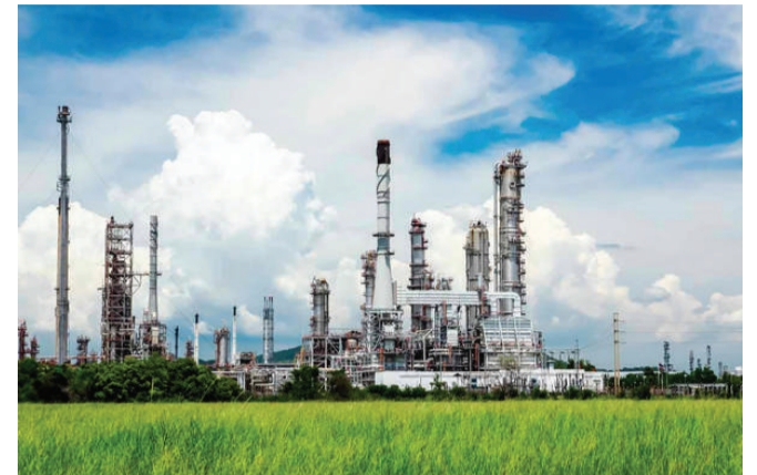
Project UNF -Navoiy - Uzbekistan

The MP pumps will be driven by a 450 kW driver and their motors will be provided by the customer, as for the HP pumps.