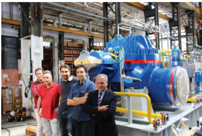
The engineering team in front of the 10000-380 MOL pump

Therefore, when the customer, KONAR, and the end user, Transneft, witnessed the final tests, they issued the certificate of acceptance of the machines.