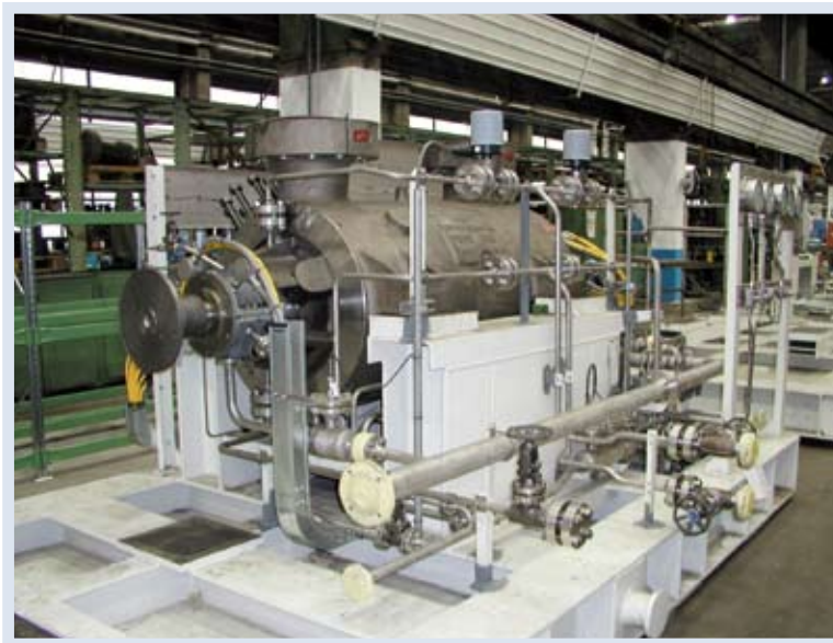
Fig.1 – Boiler feed water pumps

TM.P. SpA Termomeccanica Pompe enters into the English energy market through the supply of 18 pumps for strategic services for the new power plant operating with a CCGT (Combined Cycle Gas Turbine) of EDF Energy in West Burton (Nottinghamshire). TM.P.'s scope of supply also includes all the strategic spare parts as well as supervision during erection, commissioning and start-up.