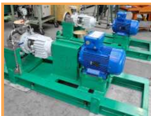
Horizontal overhung centrifugal pump single stage series AP type OH2